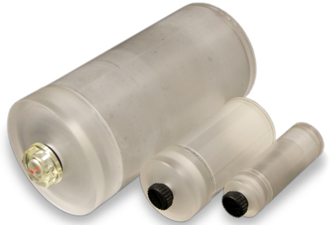
Standard versions (Ø 20, 32 and 60 mm) of the QRM Micro-CT Water Phantom