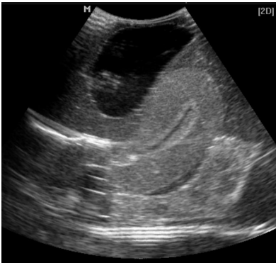
Trans-vaginal of uterus, bladder and rectum