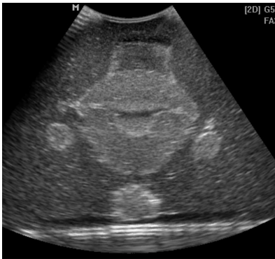
Transabdominal of uterus